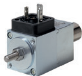
SINGLE STROKE SOLENOIDS